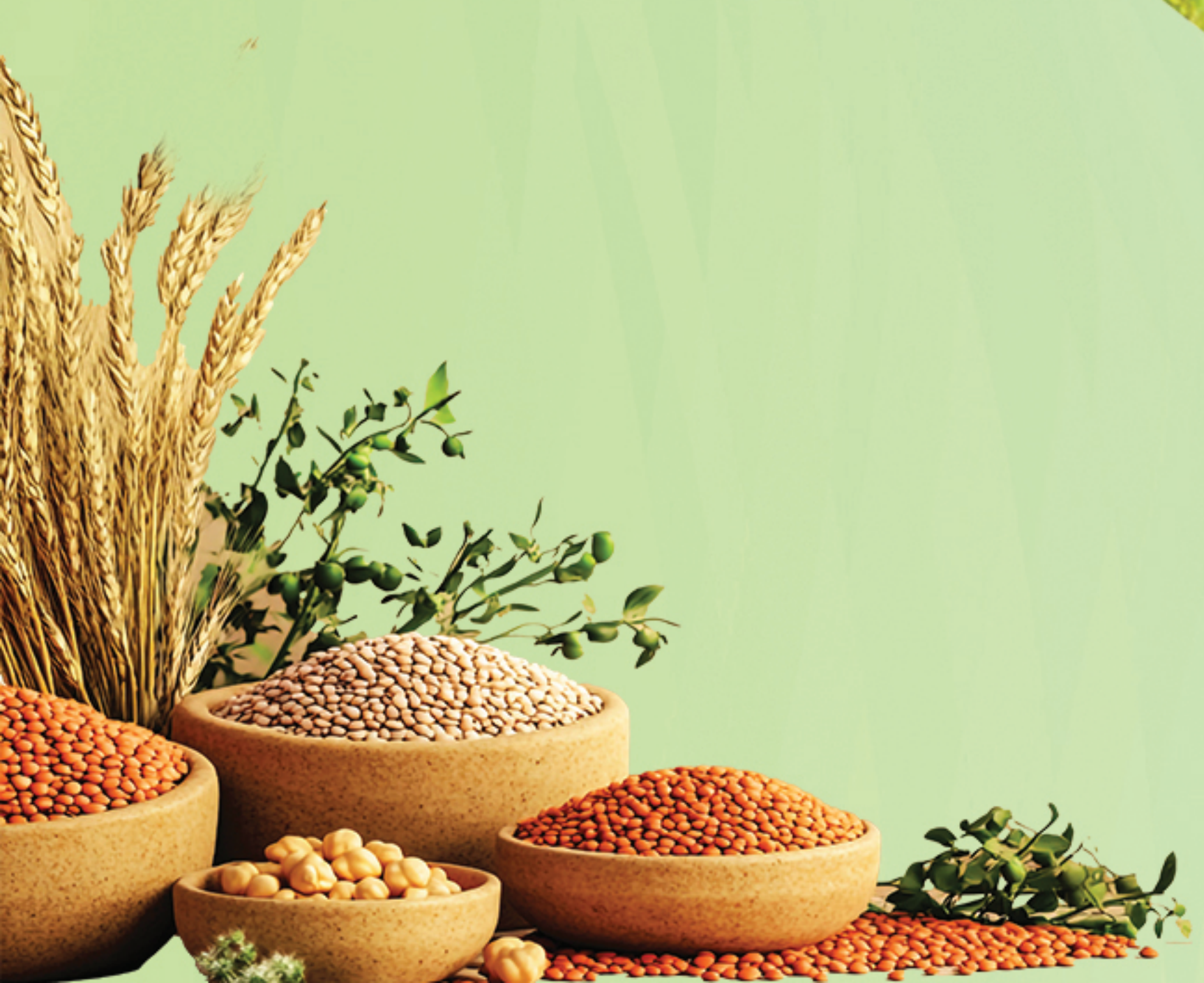
Brown Top Millet