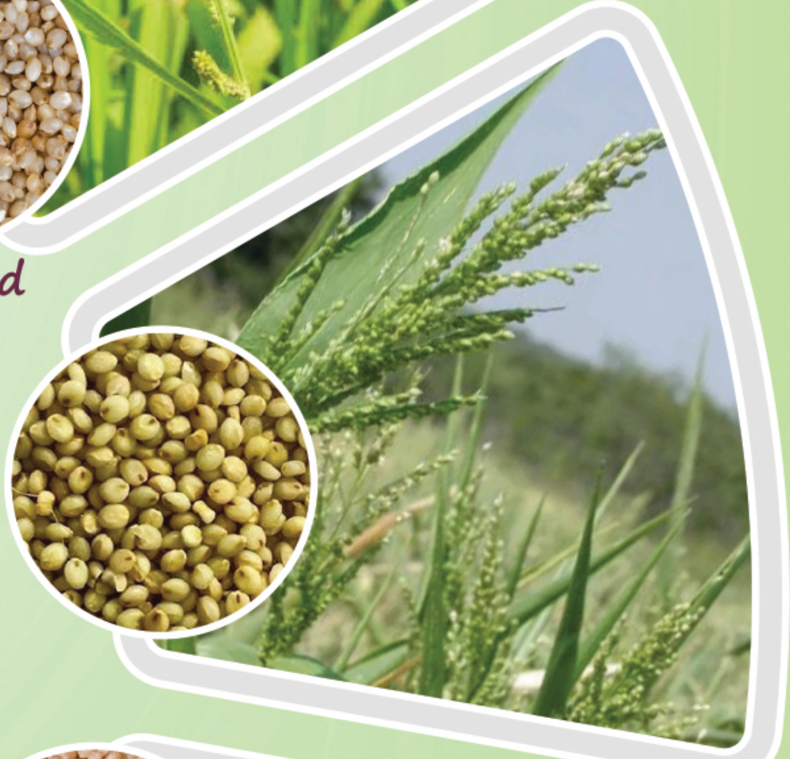
Brown Top Millet

INTERNATIONAL TRADE FAIR 2025 ORGANICS & MILLETS January 23 to 25, TRIPURAVASINI, PALACE GROUND, BENGALURU www.organics-millets.in